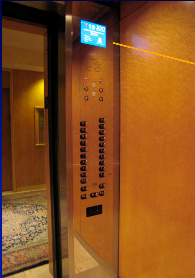
Car Panel With Luxury Position Indicator