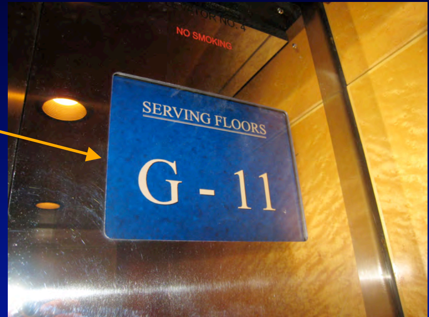
Luxury Position Indicator